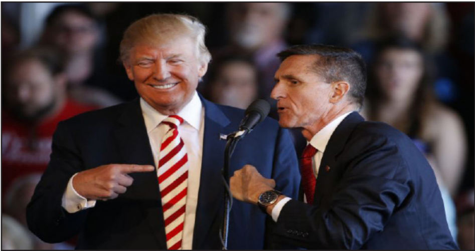
Michael Flynn’s White House resignation has sparked questions as to whether or not Donald Trump knew about his campaign’s communication with Russia.

Cain’s statements on Trump are extremely crucial in reflecting the bipartisan displeasure and distrust for Donald Trump and what he has brought to Washington. I worry about where