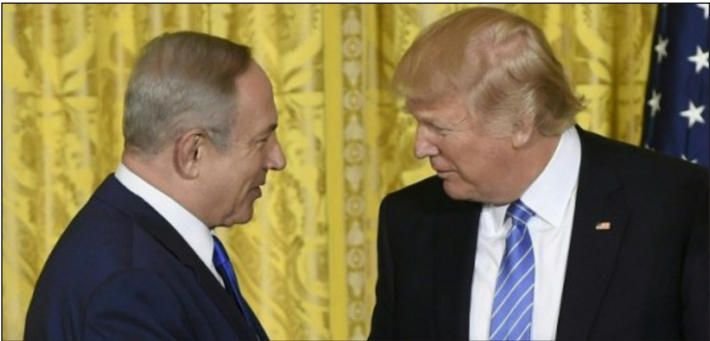
The Prime Minister of Israel, Benjamin Netanyahu, visited President Donald Trump in Washington D.C. on February 15 to discuss foreign policy and the future of American/Israeli relations.

continued from page 1 Netanyahu’s excitement for better relations between his country and America continued through the press conference. However, PM Netanyahu did not agree with everything Trump had to say. The biggest take-away from their meeting was that President Trump declared “that the United States would no longer insist on the creation of a Palestinian state,” which it has done in the past, according to the New York Times . Trump then later urged the PM to put a halt on housing construction in an area in Palestine, seemingly contradicting his earlier statement, but this seemed to be a less important matter to the Prime Minister. Netanyahu is instead focused on the conflict with his political party, which primarily believes in the two-state nation. Meanwhile, Trump said that, looking at one-state vs two-state, he “like[s] the one that both parties like,” which is the one-state system. This assertion could affect Israel-U.S. relations in the future. Another topic of their conversation was Iran. According to both Trump and Netanyahu, Iran is a threat to the safety of not only Israel, but to the rest