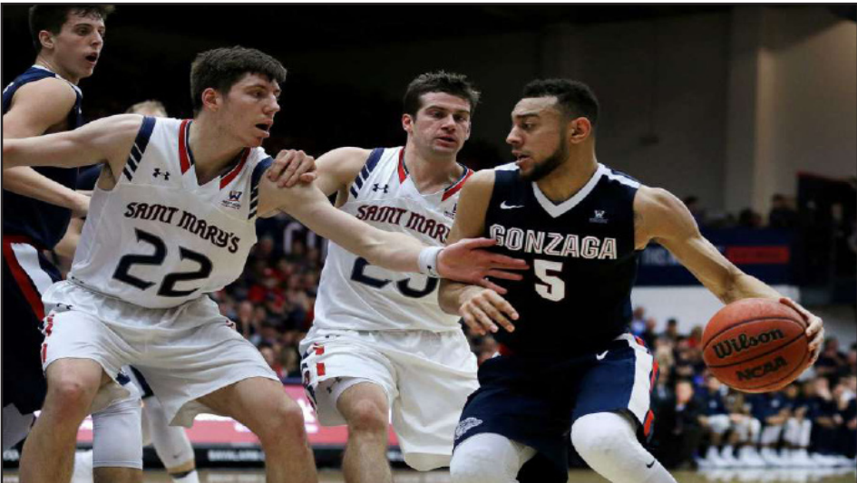
Nigel Williams-Goss and Gonzaga are the favorite to win the NCAA Tournament this year. Other teams are in the fray and March Madness should be entertaining this year.