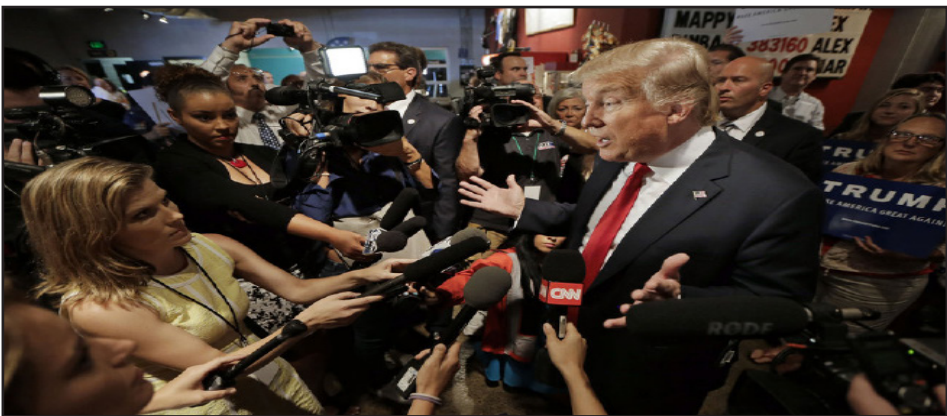
Donald Trump’s war against the press is not only unprofessional and unpresidential, but incredibly dangerous. Opposing the free press system is un-American and threatens our democracy.

allows for a balanced society, in which citizens can hold their leaders responsible and express dissatisfaction with their government. Attacking the media is inap-